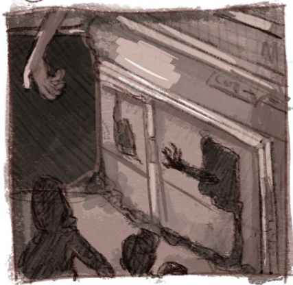
⑥ SERVICE CORRIDOR ESCAPE

Quick! The way out is through the service corridor of Site 19. Tight turns and switchbacks make each turn a dreaded surprise. Watch out for those vents – creatures are lurking where you least expect them.