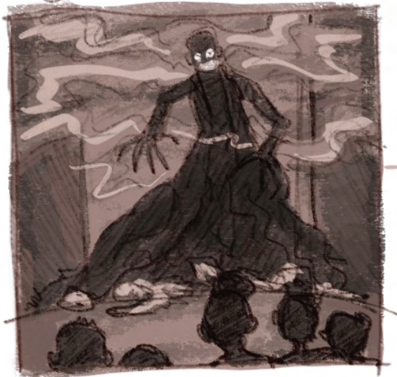
⑨ FINAL SCARE / BIG BAD

You exit the dimension onto a path to the exit. SCP-106 is there once again, rising above the ground and reaching for you as you make your escape.