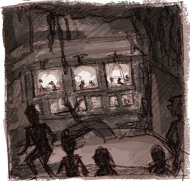
⑧ CORRUPTED CONTROL ROOM

The control room is turned upside-down in the new dimension. On the few monitors that are still functioning, you can see the Theme Park outside Site 19, infested with SCP creatures. It is their world now.