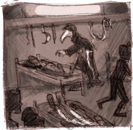
⑤ OPERATING ROOM

Upon exiting the new dimension, you come out into Site 19's medical facility, which has been taken over by the Plague Doctor. Many of his deformed and disfigured patients are dead, but a few are still moving. Careful—the remaining patients with a pulse are no longer acting very...human.