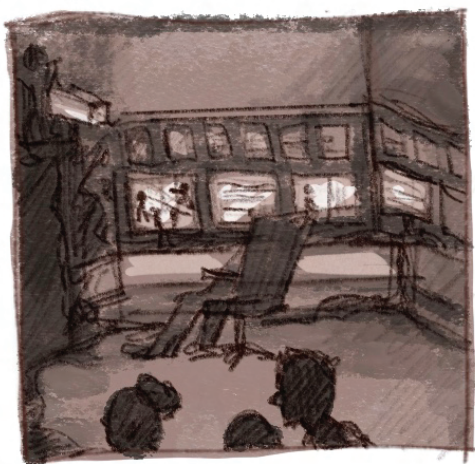
⑦ CONTROL ROOM

At the end of the corridor, you reach Site 19's security room. A large wall of screens greets you, and you can catch glimpses of other guests making their way through Site 19. SCP-106 is following you and the only escape is through another portal.