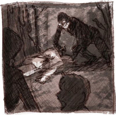
④ CORRUPTED DIMENSION

In the new dimension, you catch your first glimpse of SCP-106, feeding on the body of the decayed scientist. Several other Site 19 employees have fallen here, dead and corroded.